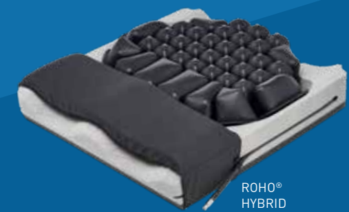
ROHO® HYBRID ELITE SR®