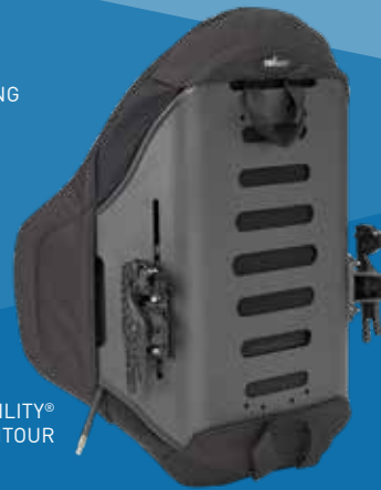
ROHO® AGILITY® MAX CONTOUR