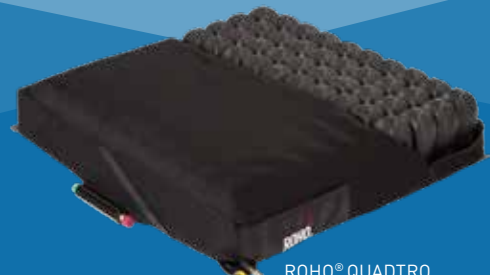
ROHO® QUADRO SELECT® HIGH PROFILE®