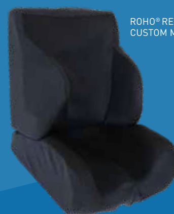
ROHO® REFLECTION® CUSTOM MOLDED SEATING