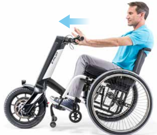
2. Press forward to lock into position and go.