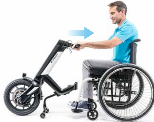
1. Pull in and lock into position