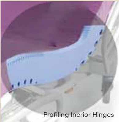
Profiling Interior Hinges