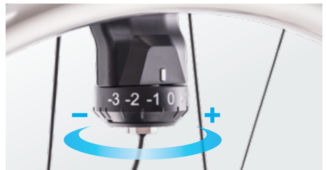
Adjustable sensitivity of the drive sensor in seven steps