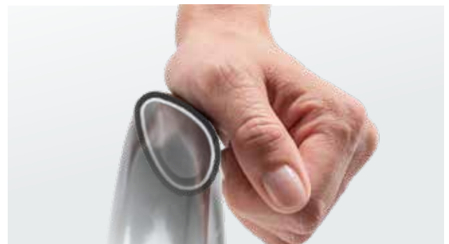
Optional coated pushrim with ergonomic shape for users with limited hand or triceps function (e.g. Quadriplegics)