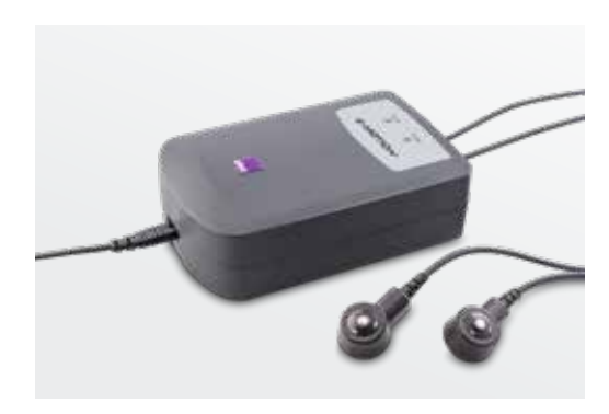
Automatic battery charger: Automatically adapts to the mains voltage and charges both e-motion batteries in a few hours (included in the scope of delivery)