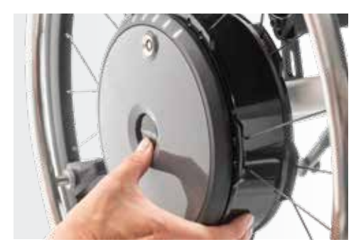
Quick and easy: The e-motion wheels can be attached and removed in no time at all using the quick-release mechanism.

Whether at work, shopping or in leisure time: the e-motion is extremely manoeuvrable and is as easy to move as a manual wheelchair in any situation. The e-motion wheels can be removed from the wheelchair in a single movement and loaded into any boot. The manual wheels can usually still be used with the same wheelchair. The e-motion is always with you when you're travelling, and you can even take it on board a plane.