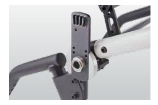
Light and discreet: the pre-assembled bracket on the wheelchair for docking the e-motion wheels