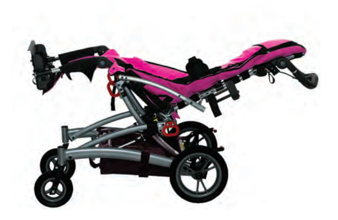
RODEO: EASY: If you prefer a simple approach yet still want to maintain 45° of tilt then the Rodeo with its clamshell fold flat design and adjustable tension upholstery is the choice for you.