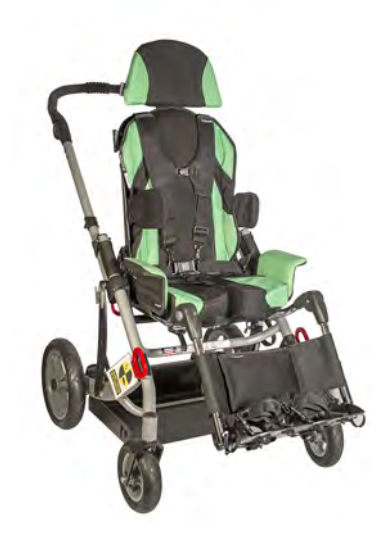
TREKKER: ADAPTABLE: The Trekker is a lightweight foldable system that can also be rotated for rear facing position. The Trekker features a highly customizable seating module that can be removed from the base. Offers optional recline and positioning.

Whatever your preference – R82 Convaid will have you on the move in no time!