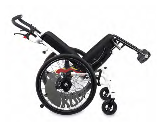
KUDU: MANEUVERABLE: For those caregivers and users requiring a weight shifting tilt in a non-traditional look, the Kudu offers effortless tilting and an unique self-propelling wheel configuration option.