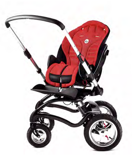
STINGRAY: BEAUTIFUL: The Stingray features Danish design and a 180° turnable seat that allows the child to face rearward or backward. The 180° turn can be accomplished without removing the seat or the child.