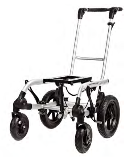
MULTI PURPOSE: The Multi purpose and Multi Purpose X frames are the perfect complement to the innovative X:Panda seating system with a Dynamic Back option. The lightweight, low profile design is combined with an easy interface for the X:Panda to allow easy removal.