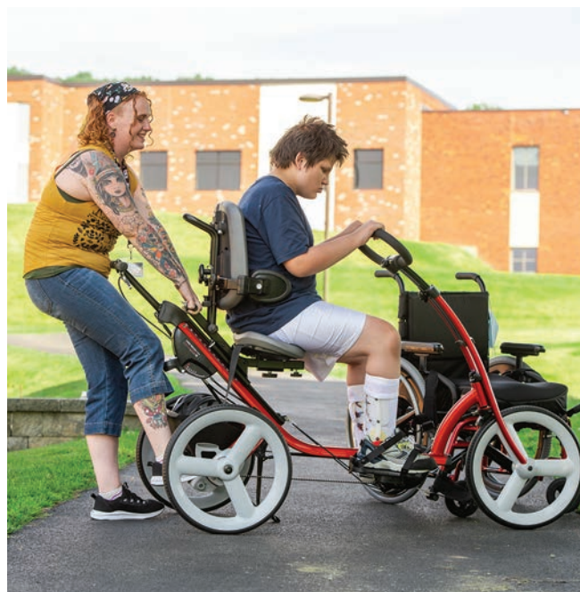
The seat glides up and down on a low-friction rail. This rider pushes with his feet to help his caregiver raise the seat.