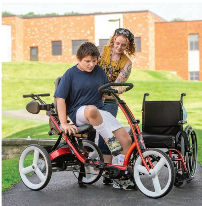
The laterals and handlebar swing away for easy transfers.