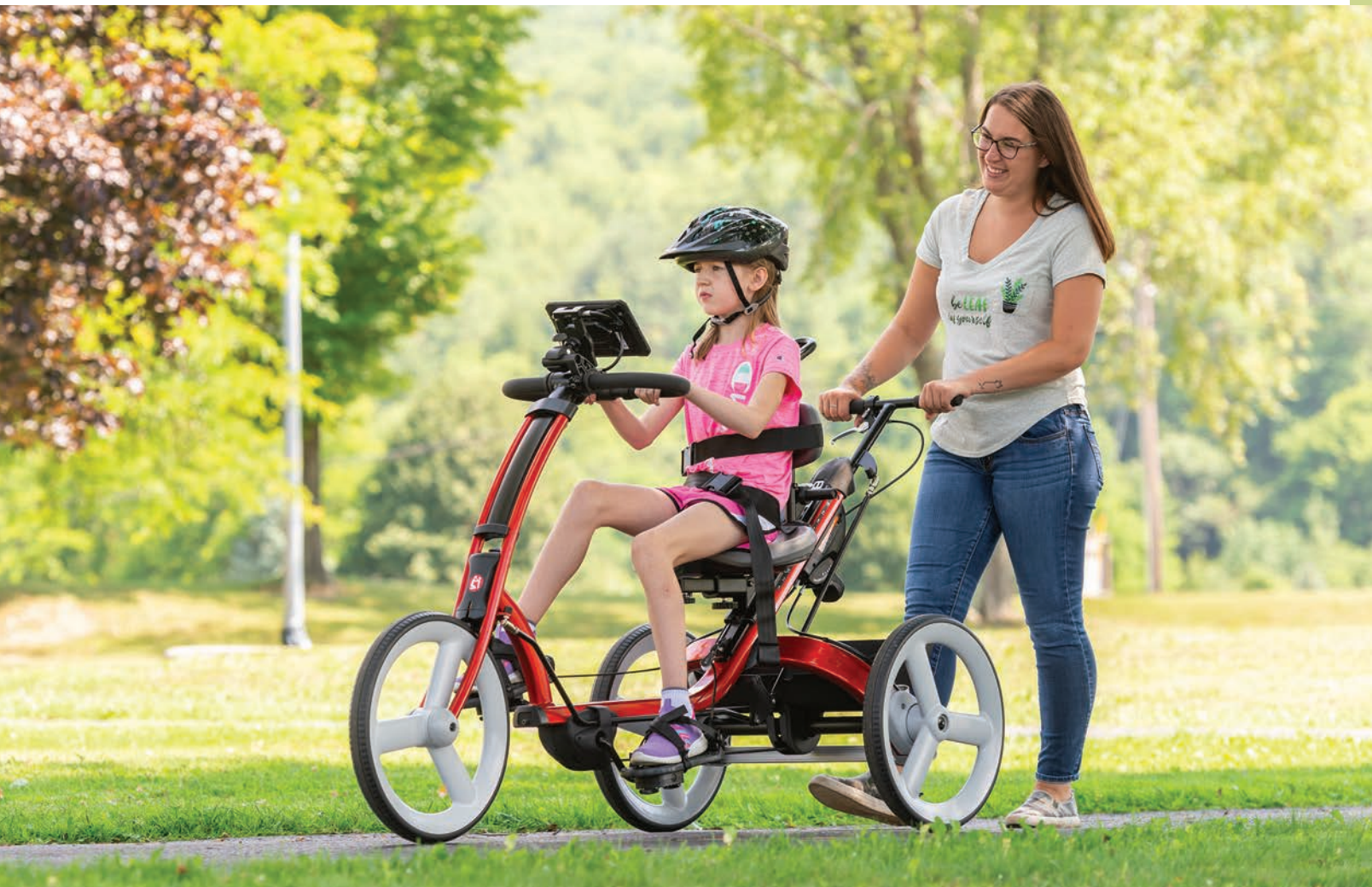
Riders feel more independent when a caregiver assists from behind with the rear steer.