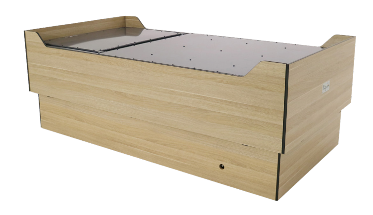
*** Pictured with optional back rest ***