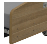
Secure bolt on head & footboards