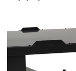
Enclosed mattress supports