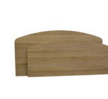
Curved Natural Oak head & footboard