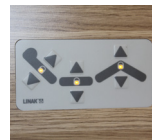
Embedded footboard control