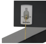
Key power lockout (as shown)