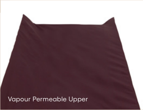
Vapour Permeable Upper